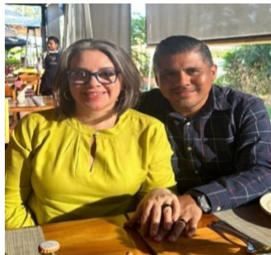
To God be the glory!